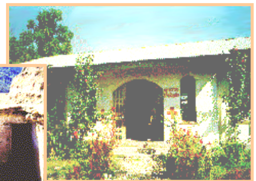
Primary Healthcare Centres, Nepal Procurement Supervision of Equipment & Drug Supply