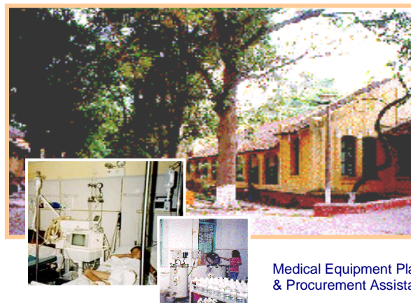
Medical Equipment Planning & Procurement Assistance