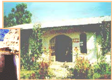
Primary Healthcare Centres, Nepal Procurement Supervision of Equipment & Drug Supply