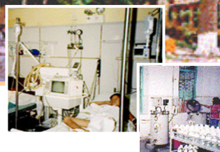
Medical Equipment Planning & Procurement Assistance