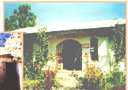
Primary Healthcare Centres, Nepal Procurement Supervision of Equipment & Drug Supply